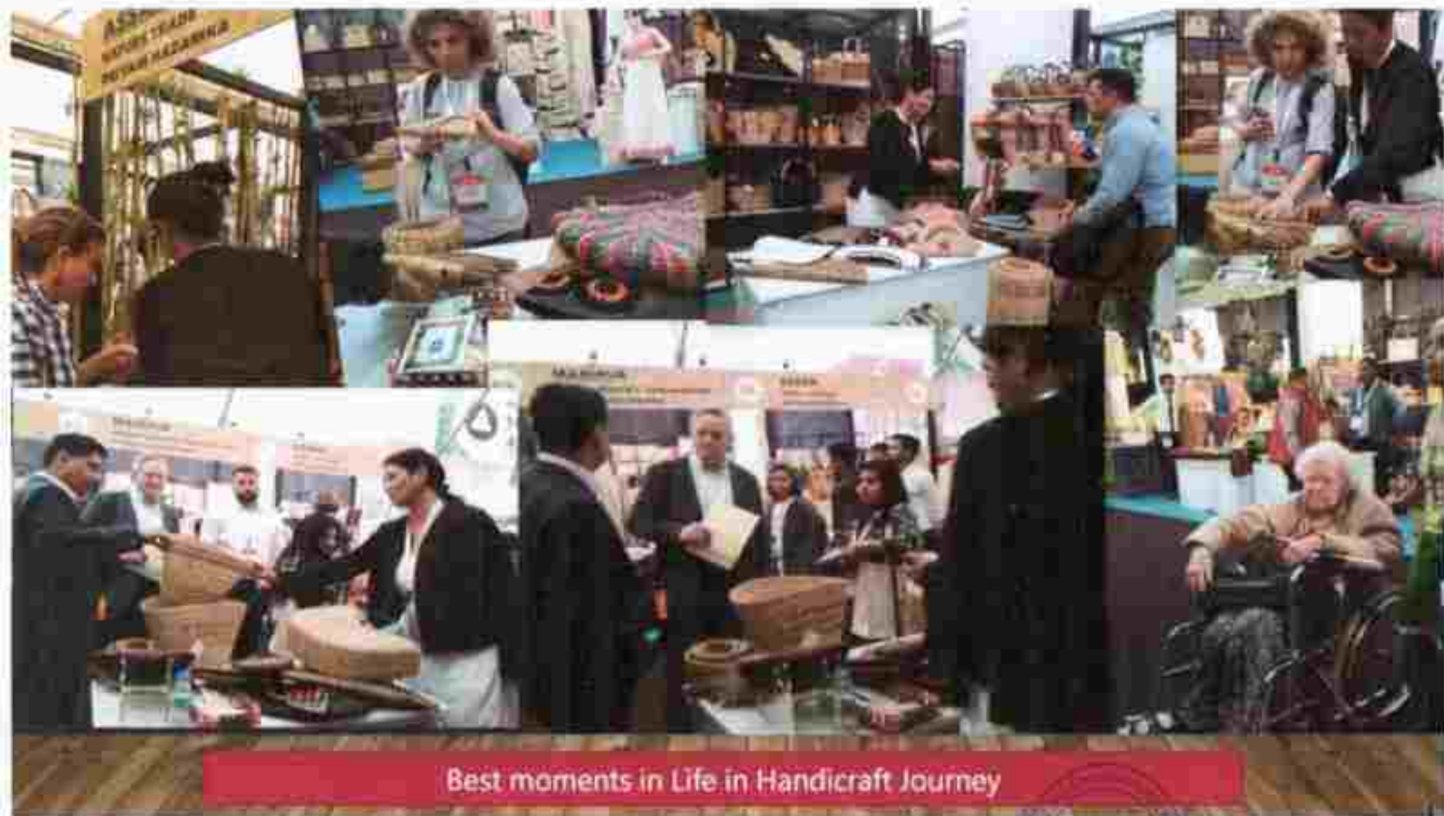
Best moments in Life in Handicraft Journey