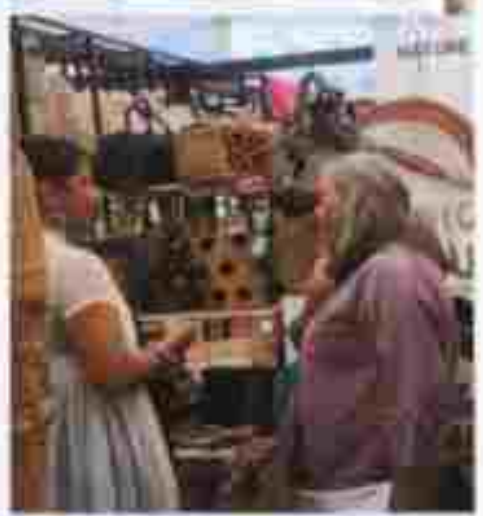
Happy moments with International Buyers