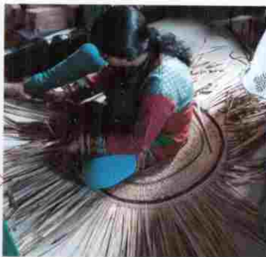
Weaving hyacinth Matt