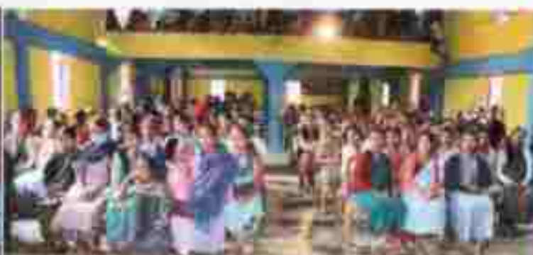
Artisans Attend the Craft Awareness Camp on 8 th December 2021 at Seng Khasi Hall , Sytein.