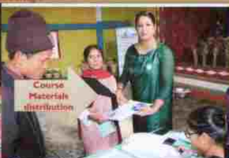
Course Materials distribution