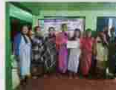
Large Group Discussion for Formation of Producer Company in Adopted Syntein Cluster with SHG groups and Village Headman