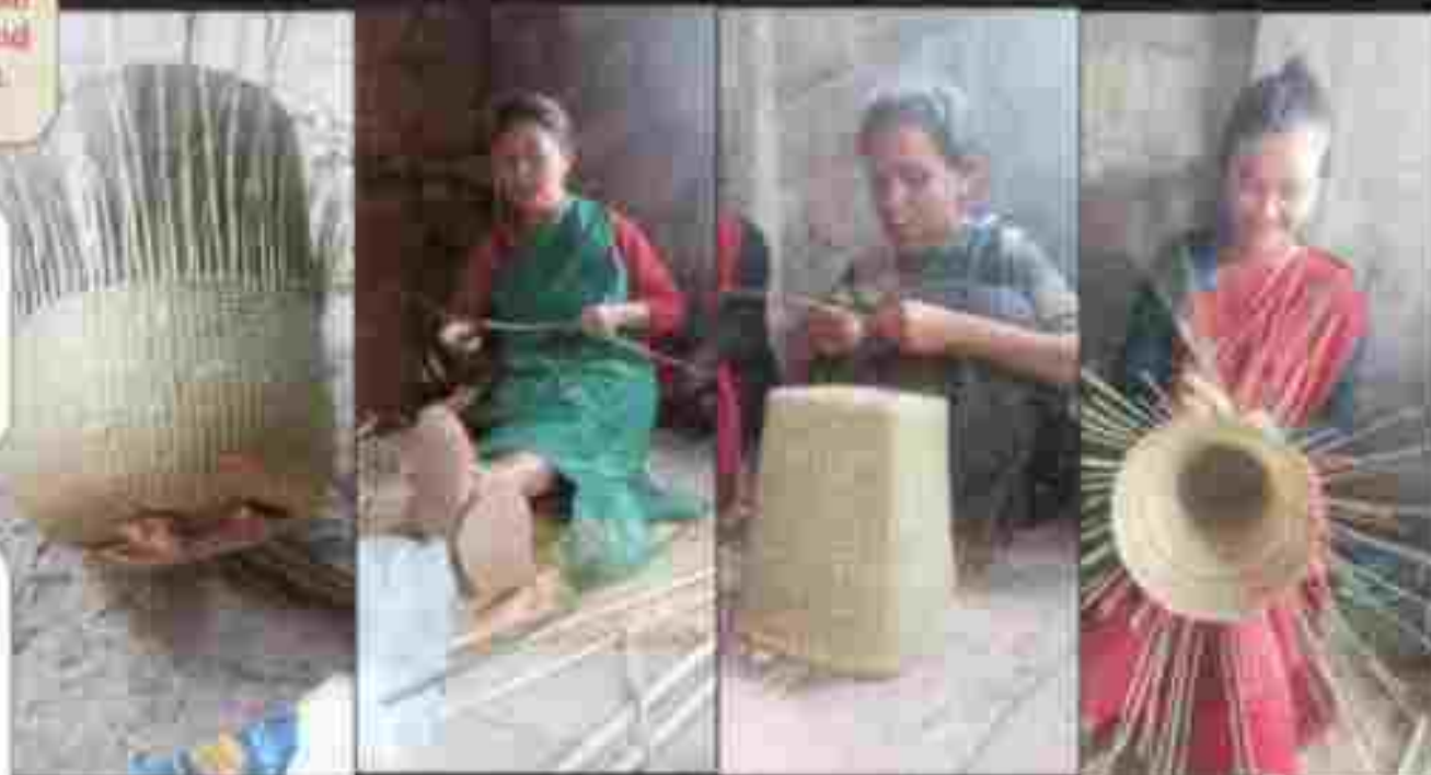
CLUSTER ARTISANS WEAVED BAMBOO PRODUCTS

Syntein Cluster is famous for Cane & Bamboo.