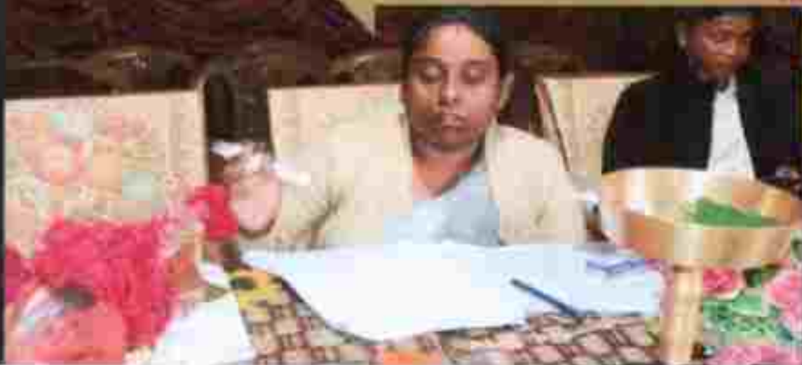
Assistant Director and Village Headman presided the Craft Awareness meeting.